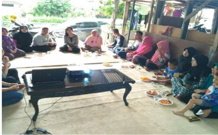
Figure 2. Discussion with street vendors for product development and business places.