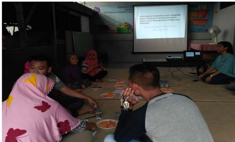
Figure 3. Training on promotion and customer service techniques.

Services is all forms of intangible human activities that can meet the needs and desires of others to satisfy each other through exchanges simultaneously. Services is intangible, heterogeneous, produced and consumed simultaneously and cannot be stored or cannot rot. (Norman, 1991).