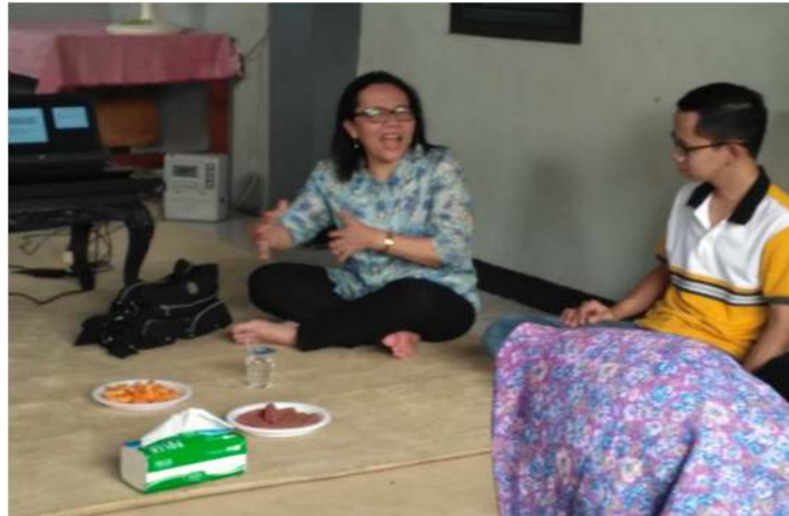
Figure 1. Discussion of street vendor issues with the chairman of the Citizen Association.

Street vendors begins to realize that both goods and services are used to satisfy consumer needs. Product is an important factor and is a central point in marketing. All marketing activities are used to support product marketing. It does not matter how great the promotion, distribution and good prices, if it is not followed by a good quality product and liked by consumers, then the marketing strategy will be in vain and will not succeed.