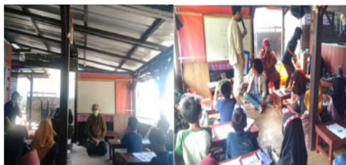
Figure 3. Explanation of activity plans & Ice Breaking activities at the beginning of training