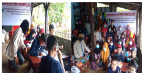
Figure 4. Mentoring by student assistants & Take a cheerful picture together at the closing ceremony