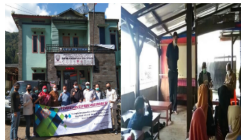
Figure 2. Team Acceptance by Citengah Village Head & Opening by Team Leader

The following are some documentation of photos of the implementation of activities from the reception by the Head of Citengah Village, the opening by the Team Leader until the closing of the event.