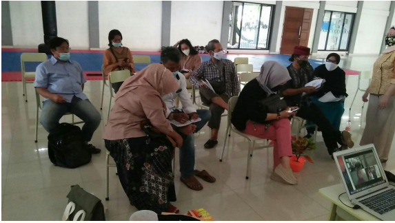
Figure 6. Training on good manufacturing practice (GMP)