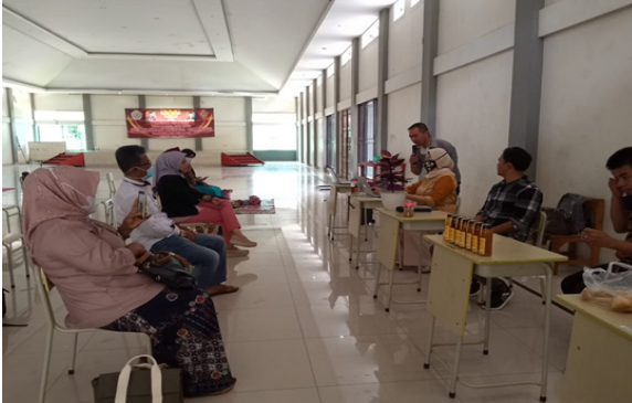
Figure 1. Offline community service activities

The series of community service activities for Culinary Entrepreneurs of the Region IV-Banten “Lembaga Barisan Muda Wirausaha Indonesia” were carried out simultaneously on Saturday, February 27, 2021 at the Ar Rahman Training Center BSD-South Tangerang. Due to the COVID-19 pandemic, the activities consist of offline and online through Zoom Meeting media (Figure 1 dan 2).