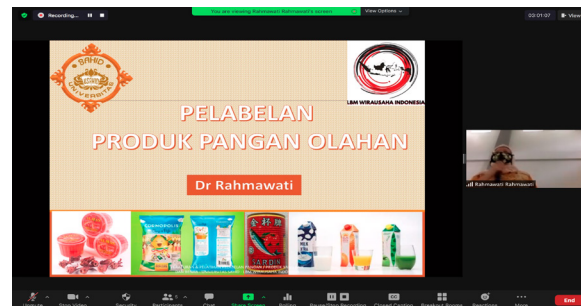
Figure 4. Training on labeling of processed food products (online)

The socialization of regulations and training for processed food product labeling aims to make partners aware of the correct label requirements for food products in accordance with the Regulation of the National Food and Drug Agency (BPOM) No 31 of 2018 concerning Processed Food Labels. This activity is carried out offline. The Socialization of Regulations and Training on Labeling Processed Food Products can be seen in Figures 4 and 5.