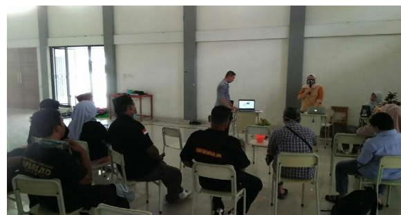
Figure 5. Training on labeling of processed food products (offline)