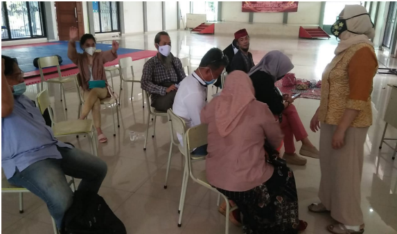
Figure 7. The evaluation

To find out that there is an increase in partner knowledge regarding the training, we gave pre and post tests to the partners. There are 10 questions related to the training material with the same questions for the pre and post tests. Based on the results of the assessment, 88% of the trainees got the higher scores on the post-test than on the pre-test. The pre and post tests were only given to participants who attend offline training. The evaluation activities for the training provided can be seen in Figure 7.