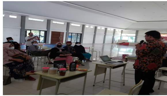
Figure 3. Socialization of food registration certification regulations

The socialization of food registration certification regulations need to be carried out because food distribution permits cannot be obtained easily and take a long time, high costs, and quite a lot of requirements. So the partners need to be provided with sufficient knowledge regarding this matter. The socialization activity for the food registration certification regulations can be seen in Figure 3.