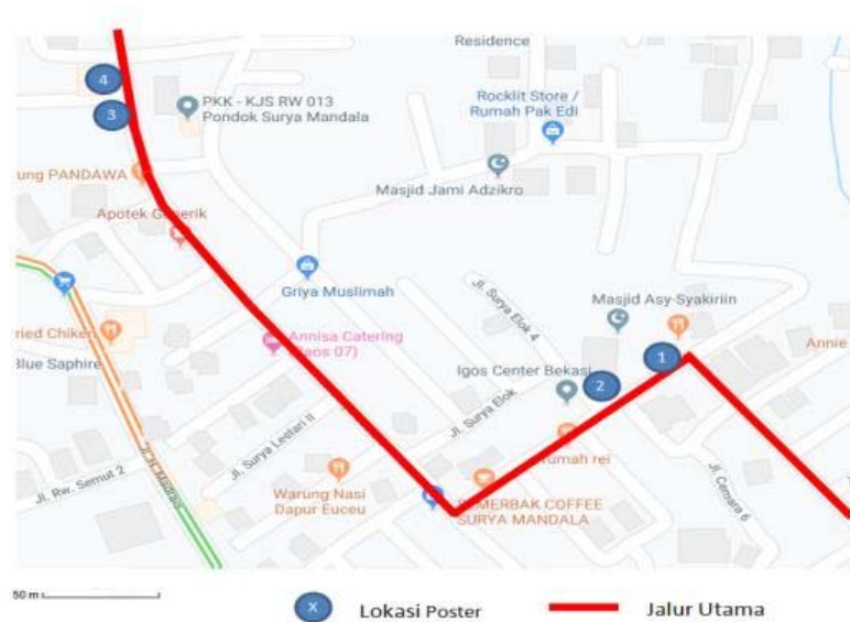
Picture 6. Poster installation location