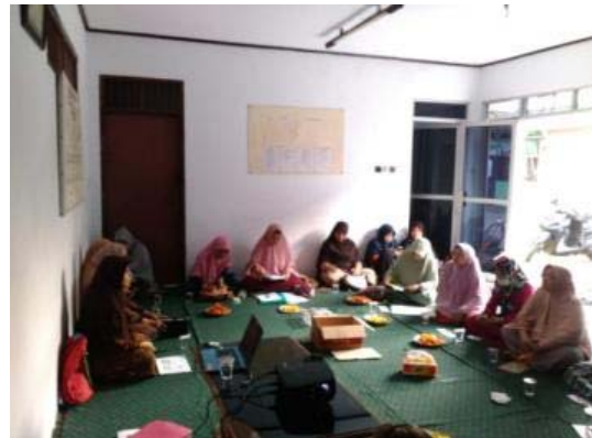
Picture 4. Discussion atmosphere

In the discussion also discussed the use of cooking oil in traders too often have been heard, but in practice it is very difficult not to buy fried food at the merchant. The answer to this question is the same as in the previous answer that what causes oil to damage. How fried food sellers use cooking oil. We should indeed manage our own food at home. If forced to do so the best way is to become the first buyer because cooking oil is still being used at that time.