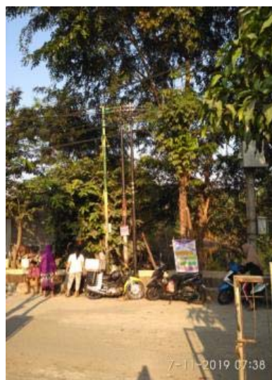
Picture 7. Poster installation photo around Balai RW

Picture 6 shows that the poster for healthy oil use is on the side of the road around Balai RW and Asy Syakirin Mosque (blue 1 and 2). The distance between Balai RW and Asy Syakirin Mosque is 350-400 m. Posters around the Balai RW can be seen in Picture 7. Picture 7 shows the poster that has been installed around the RW hall. This aims to be seen by many people, because around the Balai RW gathered vegetable traders, fishers, stalls and other traders, so that in that place many mothers gather to shop. It is hoped that the poster can be read and add to knowledge and recall. Posters around Asy Syakirin Mosque can be seen in Picture 8.