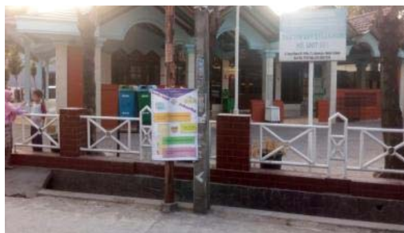
Picture 8. Poster around the Asy Syakirin Mosque

Picture 8 shows that posters can be seen around the As Asirinirin mosque. Asy Syakirin Mosque is in the middle of Pondok Surya Mandala Housing. Seen from across the road in front of the mosque, a poster for the use of healthy oil was installed on the side of the road around the mosque asy syakirin. Installation in the mosque because many people are passing by to the mosque so it is expected to be seen by mothers or other community groups.