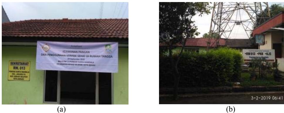
Picture 2. Balai RW: (a) Front view of Balai RW and (b) front yard of Balai RW

In the implementation of outreach, counseling is done by lecturing and discussion methods. The resource person has presented material on the use of healthy oil which is supplemented by the results of research into the use of cooking oil in catfish pecel traders in Bekasi as well as other related research. Before the material is given, participants are asked to do a pre-test, although it seems that there are many who are not ready to do the pre-test but still the participants can do everything they can. Lecture delivery of material went smoothly and well using the LCD. Before the material is given, participants are asked to do a post test. The discussion carried out went smoothly. Discussions are held with participants asking questions to resource persons related to the material that has been submitted. There were two participants who asked questions. In accordance with the counseling plan, it is carried out at Balai RW. Balai RW can be seen in Picture 2.