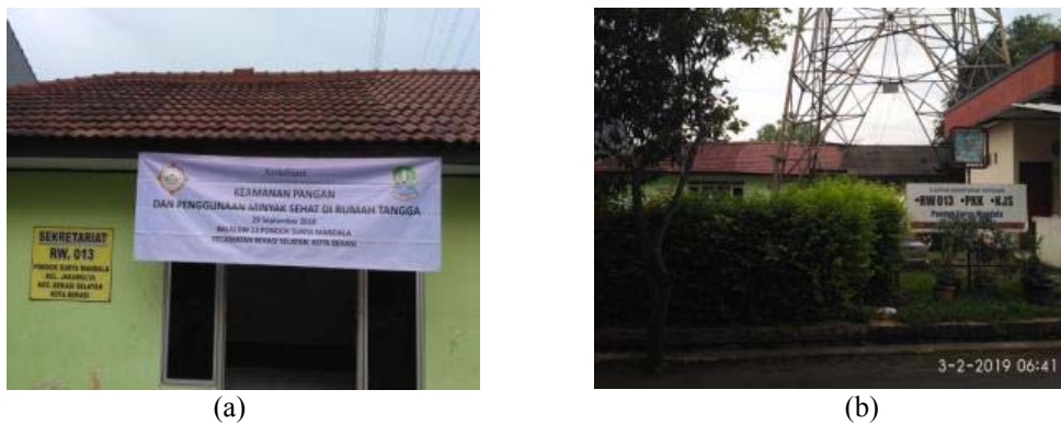
Picture 2. Balai RW: (a) Front view of Balai RW and (b) front yard of Balai RW

In the implementation of outreach, counseling is done by lecturing and discussion methods. The resource person has presented material on the use of healthy oil which is supplemented by the results of research into the use of cooking oil in catfish pechel traders in Bekasi as well as other related research. Before the material is given, participants are asked to do a pre-test, although it seems that there are many who are not ready to do the pre-test but still the participants can do everything they can. Lecture delivery of material went smoothly and well using the LCD. Before the material is given, participants are asked to do a post test. The discussion carried out went smoothly. Discussions are held with participants asking questions to resource persons related to the material that has been submitted. There were two participants who asked questions. In accordance with the counseling plan, it is carried out at Balai RW. Balai RW can be seen in Picture 2.