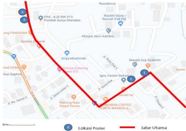
Picture 6. Poster installation location