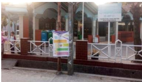
Picture 8. Poster around the Asy Syakirin Mosque

Picture 8 shows that posters can be seen around the Asy Syakirin mosque. Asy Syakirin Mosque is in the middle of Pondok Surya Mandala Housing. Seen from across the road in front of the mosque, a poster for the use of healthy oil was installed on the side of the road around the mosque asy syakirin. Installation in the mosque because many people are passing by to the mosque so it is expected to be seen by mothers or other community groups.