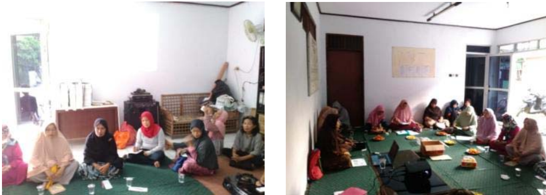
Picture 4. Discussion atmosphere

In the discussion also discussed the use of cooking oil in traders too often have been heard, but in practice it is very difficult not to buy fried food at the merchant. The answer to this question is the same as in the previous answer that what causes oil to damage. How fried food sellers use cooking oil. We should indeed manage our own food at home. If forced to do so the best way is to become the first buyer because cooking oil is still being used at that time.