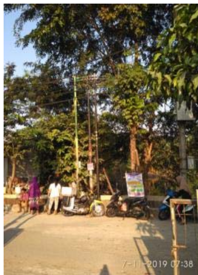
Picture 7. Poster installation photo around Balai RW

Picture 6 shows that the poster for healthy oil use is on the side of the road around Balai RW and Asy Syakirin Mosque (blue 1 and 2). The distance between Balai RW and Asy Syakirin Mosque is 350-400 m. Posters around the Balai RW can be seen in Picture 7. Picture 7 shows the poster that has been installed around the RW hall. This aims to be seen by many people, because around the Balai RW gathered vegetable traders, fishers, stalls and other traders, so that in that place many mothers gather to shop. It is hoped that the poster can be read and add to knowledge and recall. Posters around Asy Syakirin Mosque can be seen in Picture 8.