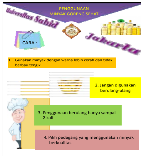
Picture 5. Poster of the use of healthy cooking oil

The poster for the use of healthy oils was carried out to remind present participants of the information about the material that had been given. For mothers who were absent, they could see the material briefly from the poster. It is expected that there has been a transfer of knowledge from the counselors to all mothers in Pondok Surya Mandala. Poster for the use of healthy cooking oil can be seen in Picture 5.