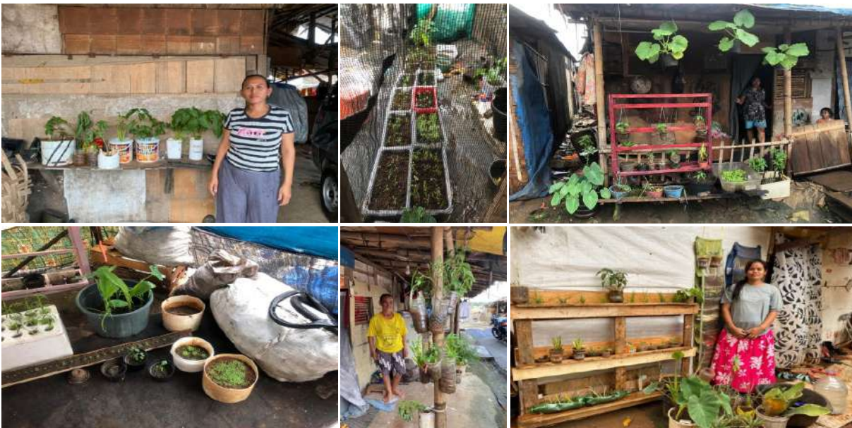
Figure 4. The simple POKIMAS making in 10 target households