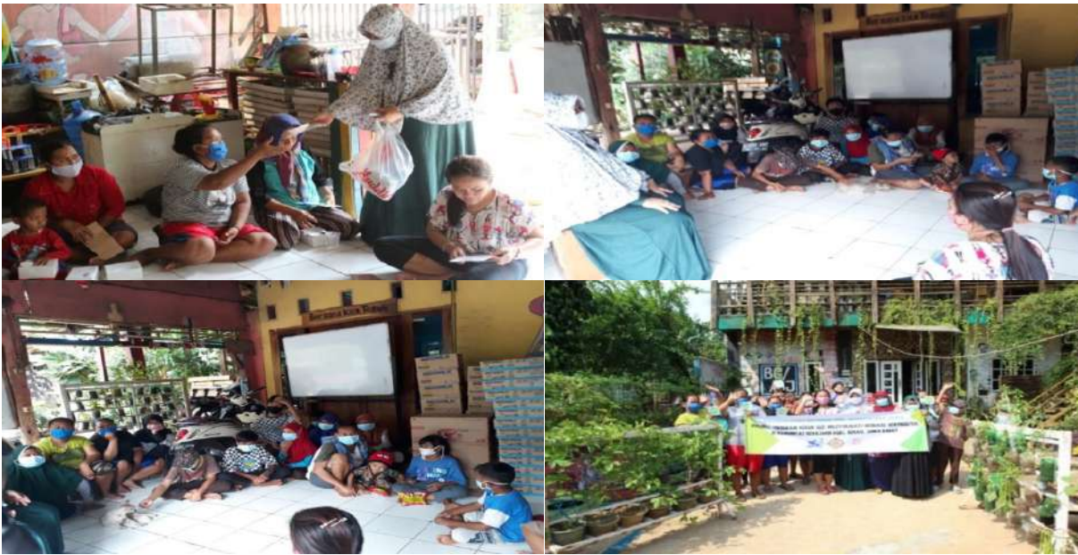
Figure 3. FGD activity with the BGBJ Community