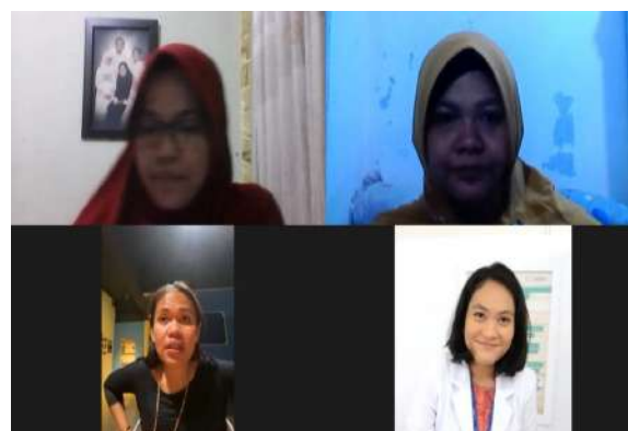
Figure 2. TOT Coordination for BGBJ Team

to implement in the community. This video was made in the form of a compact disk (CD) and can also be accessed freely on the official YouTube page of the Nutrition Study Program, Faculty of Food and Health Technology, USAHID by the general public.