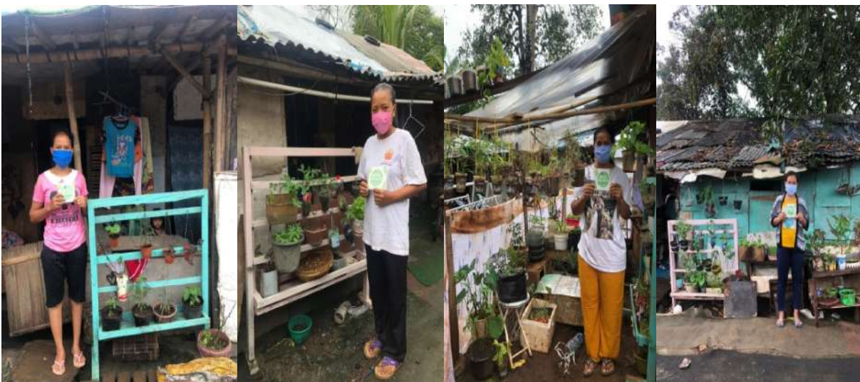
Figure 5. Assistance and program sustainability