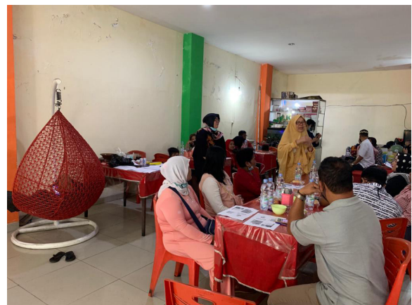
Figure 7. Presentation & Discussion

During the listening session on the problems of the street vendors, information was obtained that they had not had their assets statement. In this regard, they are directed to record the ownership of the carts, tables, chairs, kitchen utensils, and eating utensils as assets, debts, or rent. They also have not recorded their income and expenses, so the presenter educated each street vendor to record all their income and expenses every day and separate expenses for business from expenses for family needs. The presenter also educated street vendors to identify daily-monthly-annual expenses to plan rent payments, purchase kitchen utensils, and to eat utensils in a more organized manner. Furthermore, street vendors understand the importance of preparing an expenditure plan to manage their expenses according to a priority scale. Then no less critical is an understanding of the benefits of the habit of saving periodically. It should be in the habit of setting aside income for savings when you receive it because if you save while waiting for the remaining funds, savings will never be collected. During a pandemic and sales slump, savings are precious.