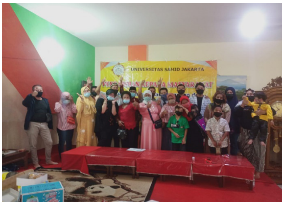
Figure 8. Street Vendors at Our Meeting

The discussion stage became an exciting session because there was an interactive dialogue between the presenter and street vendors. The silence of Pasar Raya and the decline in income are the complaints of all street vendors, so most of them have debts to cover their primary needs. Presenters provide education, so street vendors do not apply for debt on online loans because they charge very high-interest rates. It is feared that they will be in debt on online loans that swell, and eventually, their assets will be confiscated. In urgent conditions, they are directed to pay debts only to official financial institutions registered with the Financial Services Authority, such as Koperasi Simpan Pinjam, Bank Pasar, or Bank Perkreditan Rakyat. At the end of the event, the presenter motivated the street vendors to be enthusiastic about implementing business financial management and possible, hoping that they will become bankable businessmen because they have a simple operational financial statement. In addition, suggestions are given for street vendors to offer their food through social media.