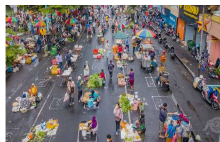
Figure 2. Physical Distancing Market

The restrictions on community activities have declined; the market is only open with limited operating hours. On Sunday, the Salatiga City Government set two meters between traders' stalls at Pasar Raya as the largest market in Salatiga. The arrangement extends to the highway. Photos of Pasar Raya Salatiga that apply social distancing, as shown in Figure 2, have gone viral on social media. Meanwhile, on other days, the market tends to be quiet because most people stay at home. The situation of Pasar Raya, which keeps its distance on this Sunday, has shifted the land which was originally an area for street