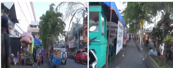
Figure 3-4. Street Vendors at Pasar Raya

The preparation stage includes identifying problems, formulating approach methods, and planning work procedures. This stage begins with studying the regulations for Restricting Community Activities in Salatiga City, where street vendors are limited to shorter operating hours. Meanwhile, people are encouraged to stay at home, so the market is quiet, and street vendors have drastically reduced their income. Then meet with the head of the street vendor association to describe the purpose of the activity and confirm the schedule of activities. She is very responsive and supports activities by coordinating street vendors with educational participants, helping to take care of licensing educational activities, even allowing her house as a place to conduct business financial management education.