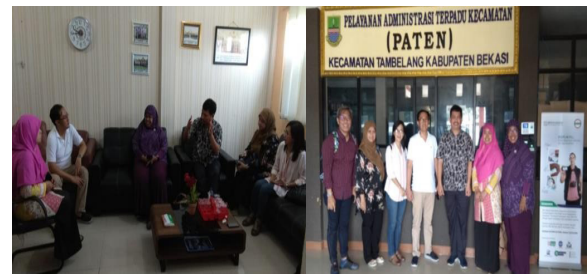
Figure 2. The signing of the MoU between Sahid University and Tambelang District