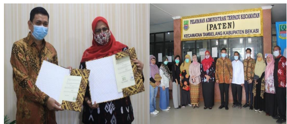
Figure 1. Team meeting with Tambelang District