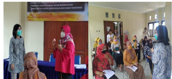
Figure 3. Socialization of the Hazards of Waste Cooking Oil

This program aims to provide socialization and understanding of the dangers of waste cooking oil for health and the environment. This program involves a group of PKK women in Sukarapih, Tambelang District, Bekasi.