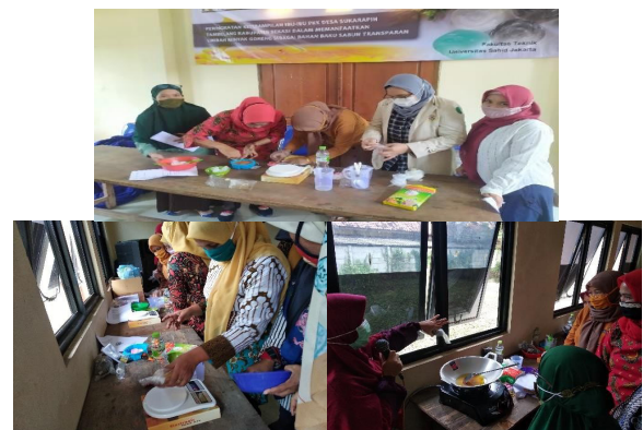
Figure 4. Training on Waste Cooking Oil into soap

Training on processing waste cooking oil into soap based on Zero Waste Industry. Fostering a culture of love for the environment based on Zero Waste Industry which consists of Reduce, Reuse and Recycle (3R). The partners involved in this activity are PKK women in Sukarapih Village, Tambelang District, Bekasi. The training was conducted by explaining the mechanism and procedures for making soap from used cooking oil, followed by the practice of making soap in groups (there were 3 groups) and reviews from other groups.