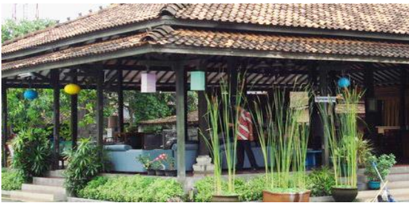
Figure 4. Tourism Facilities at Prambanan Temple