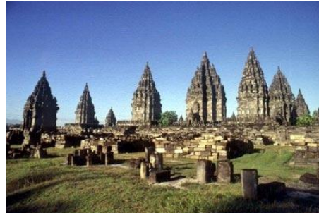
Figure 1. Shiva Prambanan Temple Sites: Before Restoration