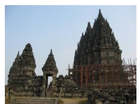
Figure 2. Shiva Prambanan Temple Sites: After Restoration

Prambanan Temple preservation until the end of 2020 is still being carried out continuously, so that its use is sustainable in the future. However, it is not all of the restoration activities been carried out on the existing temple buildings. However, all of the