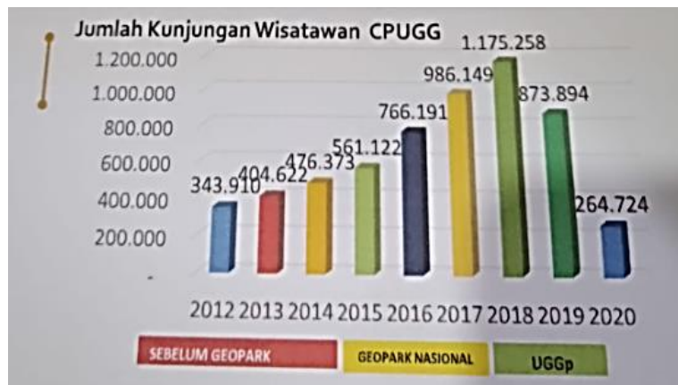
Figure 2: Tourist Visit Data for Ciletuh-Palabuhanratu Geopark