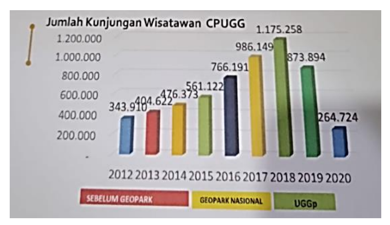
Figure 2: Tourist Visit Data for Ciletuh-Palabuhanratu Geopark