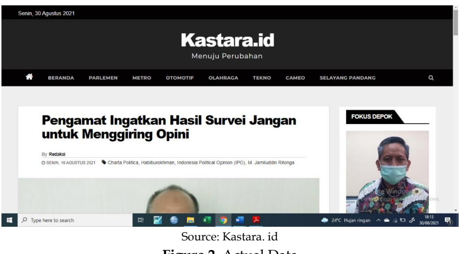
Figure 2. Actual Data

theory is developed from the conceptualization of the data, not the actual data, as in the following news: