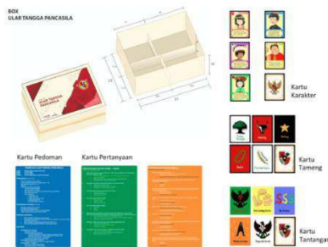
Figure 4. Snake and Ladders Equipment