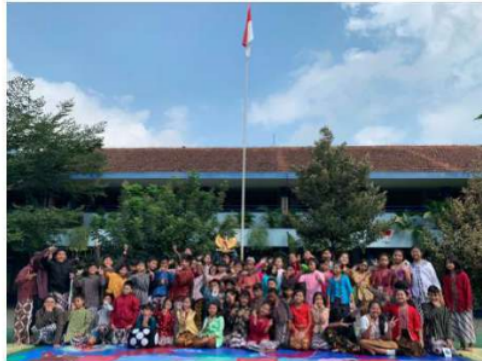
Figure 5. Snake and Ladders Simulation, Yogyakarta

Test - the design results were tested in the form of a simulation of the Pancasila ladder snake game. 6 simulations were carried out involving elementary, middle, high school and university students in the cities of Jakarta, Bali and Yogyakarta. After each simulation, a review and evaluation was conducted to improve the prototype that has been made.