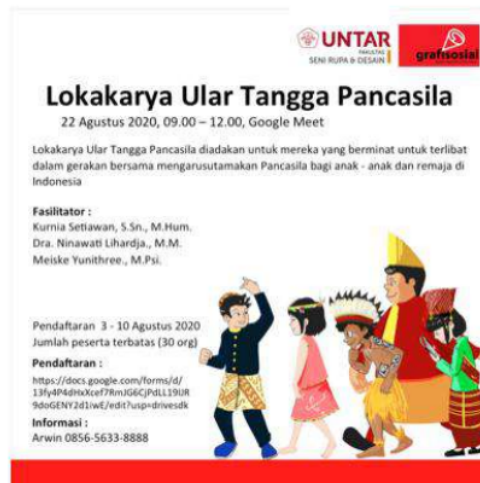
Figure 8. Snakes and Ladders Virtual Workshop (Training of Trainers)