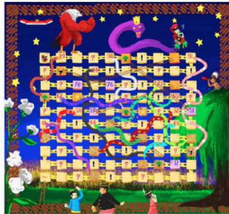
Figure 2. Snake and Ladders Boardgame (60x60 cm)

Prototype - snake and ladder design was made on a small scale first, the size of the snake and ladder game in general (60x60 cm) then continued with the development of designs on a large scale, 1: 1 (6 x 7 m).