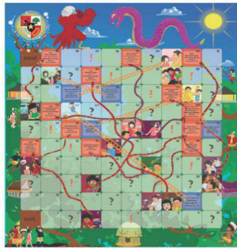
Figure 3. Snake and Ladders Banner (600x700 cm)

Prototype - snake and ladder design was made on a small scale first, the size of the snake and ladder game in general (60x60 cm) then continued with the development of designs on a large scale, 1: 1 (6 x 7 m).