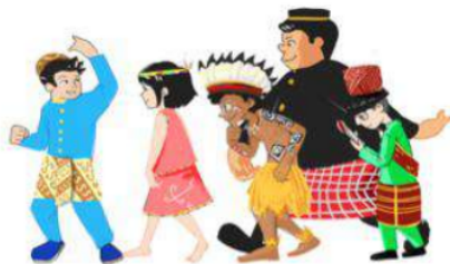
Figure 1. Character Exploration

Ideate - It is finding out ideas for innovative solutions. The idea of learning media that can attract students to learn is through interactive games. Exploration of creative ideas led to the idea of developing games for children with Snakes and Ladders as an interactive learning medium, namely by increasing the size of the game so that it can be played together in one class, adding field games and questions so that players can compete, do activities and learn. Students will be invited to play while learning about Pancasila in a fun atmosphere.