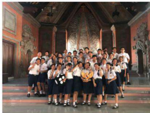
Figure 6. Snake and Ladders Simulations, Bali