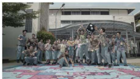
Figure 7. Snake and Ladders Simulation, Jakarta

In 2000, a Pancasila Ladder Snake Workshop (training of trainers) was held. It was attended by 94 participants from 41 regions in Indonesia. The Pancasila Snake and Ladder Game Workshop was originally planned to be offline once by inviting participants from 5 - 7 regions. In its implementation, it turned out that there had been changes due to the COVID-19 pandemic situation, it was carried out virtually with 52 people from 17 regions attended. Furthermore, new enthusiasts emerged, so it was attended by the second batch of workshops followed by 29 people from 12 regions, and the third batch attended by 13 people from 12 regions. The result of the workshop is an action plan that will be implemented in 2021 with 73 activities in 38 regions taking into account the national situation of the COVID-19 pandemic. Interviews were conducted involving 6 teachers/educational activists who participated in the Pancasila Snake and Ladder Simulation/workshop.